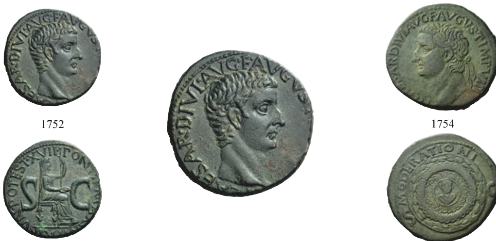
1752 As 15-16, Æ 10.83 g. Bare head r. Rev. Draped female figure seated r., holding patera and sceptre. C 17 or 19. RIC 33 or 35. Very rare. Dark green patina and about extremely fine 500