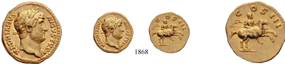
1868 Aureus 125, AV 7.23 g. Laureate bust r. with drapery on l. shoulder. Rev. Hadrian, with cloak floating behind, on horse galloping r., holding spear in r. hand. C 414. RIC 187. Calicó 1224. Good very fine 4'000