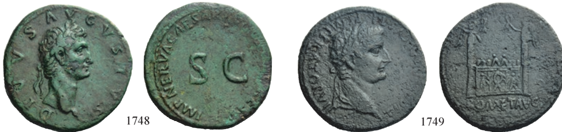
1748 Divus Augustus . Sesterterius circa 98 AD, Æ 26.06 g. Laureate head r. Rev. Legend around S C. C 570. RIC Nerva 136. Green patina and good very fine 3'500