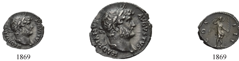
1869 Denarius 125-128, AR 3.35 g. Laureate bust r. Rev. Victory standing r. holding long palm branch in l. hand and placing r. hand on head. C 358. RIC 182. Old cabinet tone and about extremely fine 350