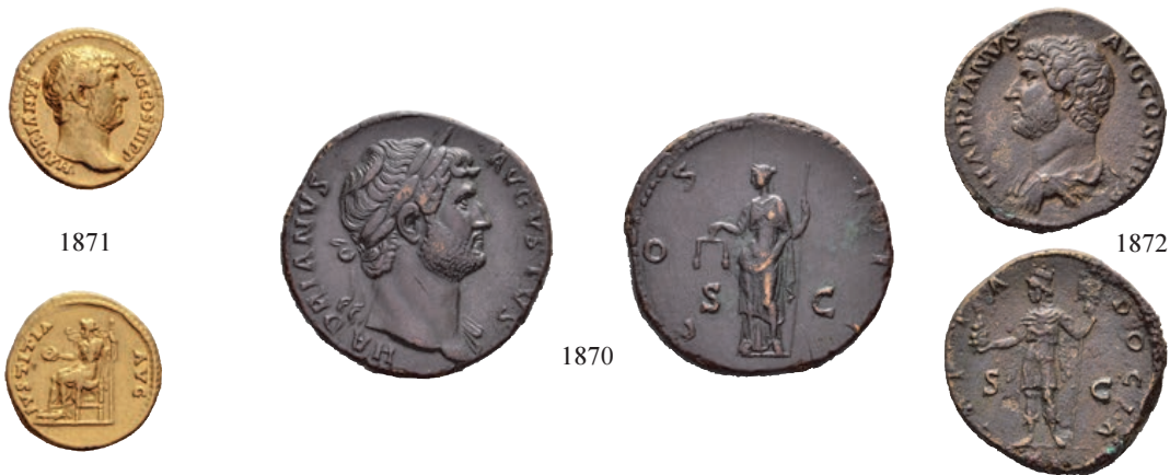
1870 Sestertius 125-128, Æ 24.54 g. Laureate head r. Rev. Aequitas standing l. holding scales in r. hand and rod in l. C 385. RIC 637d. Brown tone and very fine 600 Ex Rauch sale 79, 2006, 2366. From the Rainer Wilschke collection.