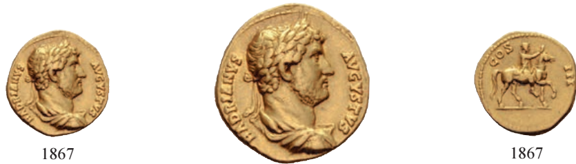
1867 Aureus 125, AV 7.16 g. Laureate, draped and cuirassed bust r. Rev. Hadrian on horseback r. C 406. RIC 186. Calicó 1216. Very fine 5'000